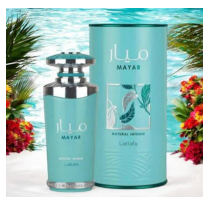
Mayar Natural R300.00 Imtense By Lattafa EDP 100ml (Blue Tin) (Dubai Replica Ladies)