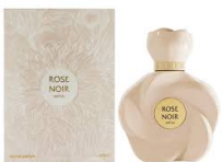
Rose Noir By R320.00 Ahmed Al Maghribi EDP 75ml (Dubai Replica Ladies)