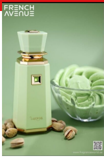
Luscious By French R350.00 Avenue EDP 100ml (Dubai Replica Ladies)