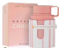
Odyssey Candee R290.00 EDP 100ml (Dubai Replica Ladies)