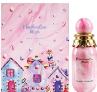
Marshmallow Blush R370.00 By Paris Corner EDP 100ml (Dubai Replica Ladies)