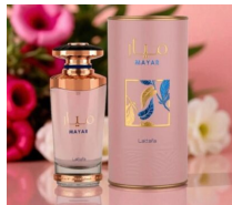
Mayar By Lattafa R300.00 EDP 100ml (Pink Tin) (Dubai Replica Ladies)