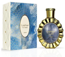
Victoria By Lattafa R340.00 EDP 100ml (Dubai Replica Ladies)