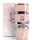
Yara By Lattafa EDP R280.00 100ml (Light Pink) (Dubai Replica Ladies)