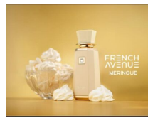
Meringue By French R350.00 Avenue EDP 100ml (Dubai Replica Ladies)