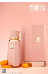
Sweet Paradise By R350.00 French Avenue EDP 100ml (Dubai Replica Ladies)