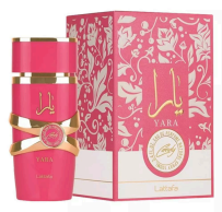
Yara Candy By R280.00 Lattafa EDP 100ml (Dubai Replica Ladies)