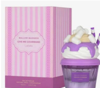
Give Me Gourmand R350.00 MALLOW MADNESS By Lattafa EDP 75ml (Dubai Replica Ladies)