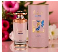
Mayar By Lattafa R300.00 EDP 100ml (Pink Tin) (Dubai Replica Ladies)