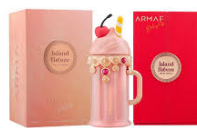
Island Breeze By R380.00 Armaf EDP 100ml (Dubai Replica Ladies)