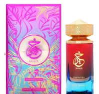
Paris Corner EDP 100ml (Dubai Replica Ladies)