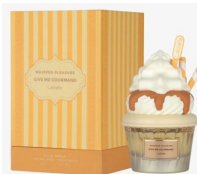
Give Me Gourmand R350.00 WHIPPED PLEASURE By Lattafa EDP 75ml (Dubai Replica Ladies)