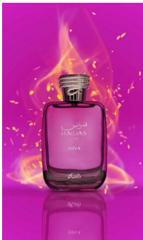
Hawas Diva By R290.00 Rasasi EDP 100ml (Dubai Replica Ladies)