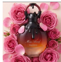
Miss Armaf R350.00 MAGNIFIQ By Armaf EDP 100ml (Dubai Replica Ladies)