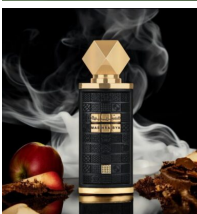
Mashrabya By R350.00 Lattafa EDP 100ml (Dubai Replica Ladies)