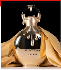
Miss Armaf VOCA R350.00 VIVA By Armaf EDP 100ml (Dubai Replica Ladies)