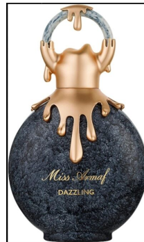
Miss Armaf R350.00 DAZZLING By Armaf EDP 100ml (Dubai Replica Ladies)