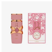
Yara ELIXIR By R280.00 Lattafa EDP 100ml (Dubai Replica Ladies)