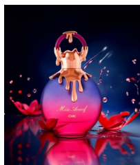
Miss Armaf CHIC By R350.00 Armaf EDP 100ml (Dubai Replica Ladies)