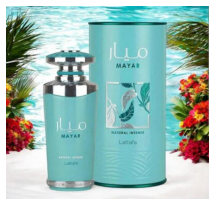
Mayar Natural Intense By Lattafa R300.00 EDP 100ml (Blue Tin) (Dubai Replica Ladies)