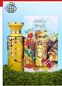
Nectar Of Ecstasy R330.00 By Fragrance World EDP 100ml (Dubai Replica Ladies)