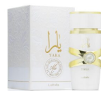
Yara Moi By Lattafa R280.00 EDP 100ml (White) (Dubai Replica Ladies)