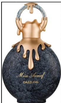
Miss Armaf R350.00 DAZZLING By Armaf EDP 100ml (Dubai Replica Ladies)