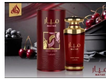
Mayar Cherry R300.00 Intense By Lattafa EDP 100ml (Maroon Tin) (Dubai Replica Ladies)