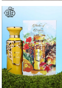
Nectar Of Ecstasy R330.00 By Fragrance World EDP 100ml (Dubai Replica Ladies)