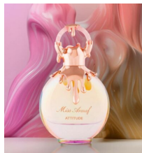
Miss Armaf R350.00 ATTITUDE By Armaf EDP 100ml (Dubai Replica Ladies)