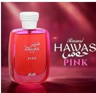
Hawas Pink By R290.00 Rasasi EDP 100ml (Dubai Replica Ladies)