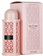
Now Women By R310.00 Rave EDP 100ml (Dubai Replica Ladies)