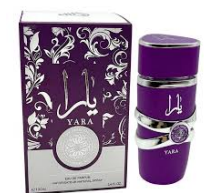
Yara Tendre By R280.00 Lattafa EDP 100ml (Purple) (Dubai Replica Ladies)