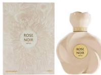
Rose Noir By R320.00 Ahmed Al Maghribi EDP 75ml (Dubai Replica Ladies)