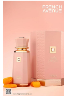
Sweet Paradise By R350.00 French Avenue EDP 100ml (Dubai Replica Ladies)