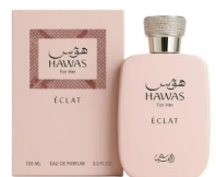
Hawas Eclat By R290.00 Rasasi EDP 100ml (Dubai Replica Ladies)