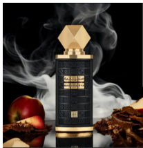
Mashrabya By R350.00 Lattafa EDP 100ml (Dubai Replica Ladies)