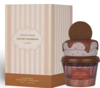
Give Me Gourmand R350.00 COOKIE CRAVE By Lattafa EDP 75ml (Dubai Replica Ladies)