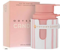
Odyssey Candee R290.00 EDP 100ml (Dubai Replica Ladies)