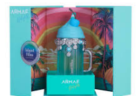
Island Bliss By R380.00 Armaf EDP 100ml (Dubai Replica Ladies)