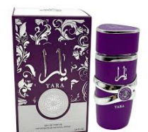
Yara Tendre By R280.00 Lattafa EDP 100ml (Purple) (Dubai Replica Ladies)