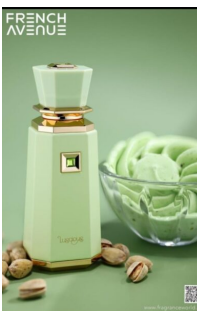
Luscious By French R350.00 Avenue EDP 100ml (Dubai Replica Ladies)