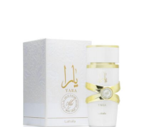
Yara Moi By Lattafa R280.00 EDP 100ml (White) (Dubai Replica Ladies)