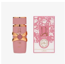
Yara ELIXIR By R280.00 Lattafa EDP 100ml (Dubai Replica Ladies)