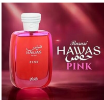
Hawas Pink By R290.00 Rasasi EDP 100ml (Dubai Replica Ladies)