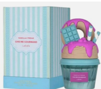
Give Me Gourmand R350.00 VANILLA FREAK By Lattafa EDP 75ml (Dubai Replica Ladies)