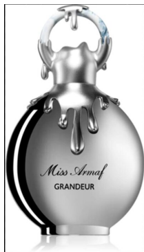
Miss Armaf R350.00 GRANDEUR By Armaf EDP 100ml (Dubai Replica Ladies)