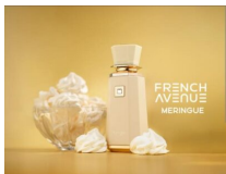
Meringue By French R350.00 Avenue EDP 100ml (Dubai Replica Ladies)