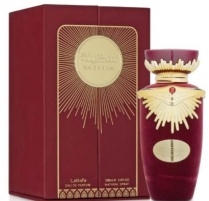
Sakeena By Lattafa R330.00 EDP 100ml (Red) (Dubai Replica Ladies)