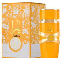
Yara Tous By R280.00 Lattafa EDP 100ml (Orange) (Dubai Replica Ladies)