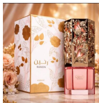
Raneen By Asdaaf R310.00 EDP 80ml (Dubai Replica Ladies)