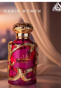
Habik Woman By R340.00 Lattafa EDP 100ml (Dubai Replica Ladies)