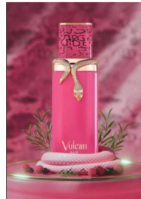
Vulcan BAIE By R320.00 French Avenue EDP 100ml (Dubai Replica Ladies)