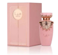
Haya By Lattafa R330.00 EDP 100ml (Dubai Replica Ladies)