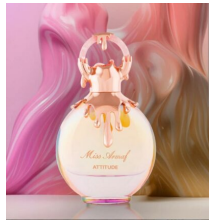
Miss Armaf R350.00 ATTITUDE By Armaf EDP 100ml (Dubai Replica Ladies)