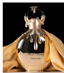
Miss Armaf VOCA R350.00 VIVA By Armaf EDP 100ml (Dubai Replica Ladies)