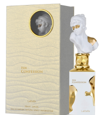
Her Confession By R350.00 Lattafa EDP 100ml (Dubai Replica Ladies)