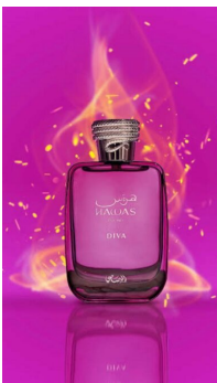
Hawas Diva By R290.00 Rasasi EDP 100ml (Dubai Replica Ladies)