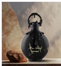
Miss Armaf R350.00 MYSTIQUE By Armaf EDP 100ml (Dubai Replica Ladies)