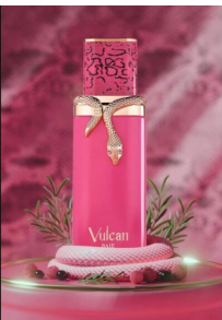
Vulcan BAIE By R320.00 French Avenue EDP 100ml (Dubai Replica Ladies)