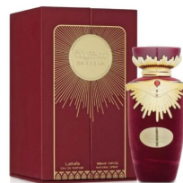
Sakeena By Lattafa R330.00 EDP 100ml (Red) (Dubai Replica Ladies)