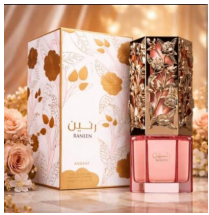
Raneen By Asdaaf R310.00 EDP 80ml (Dubai Replica Ladies)