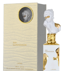
Her Confession By R350.00 Lattafa EDP 100ml (Dubai Replica Ladies)