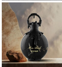
Miss Armaf R350.00 MYSTIQUE By Armaf EDP 100ml (Dubai Replica Ladies)