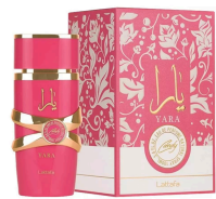
Yara Candy By R280.00 Lattafa EDP 100ml (Dubai Replica Ladies)