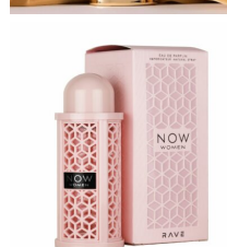
Now Women By R310.00 Rave EDP 100ml (Dubai Replica Ladies)