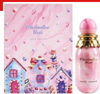
Marshmallow Blush R370.00 By Paris Corner EDP 100ml (Dubai Replica Ladies)