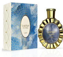
Victoria By Lattafa R340.00 EDP 100ml (Dubai Replica Ladies)