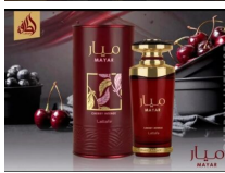
Mayar Cherry R300.00 Imtense By Lattafa EDP 100ml (Maroon Tin) (Dubai Replica Ladies)