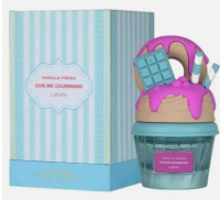
Give Me Gourmand R350.00 VANILLA FREAK By Lattafa EDP 75ml (Dubai Replica Ladies)