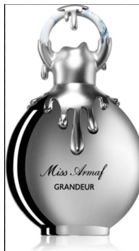
Miss Armaf R350.00 GRANDEUR By Armaf EDP 100ml (Dubai Replica Ladies)