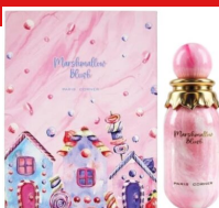
Marshmallow Blush By Paris Corner EDP 100ml (Dubai Replica Ladies) R370.00