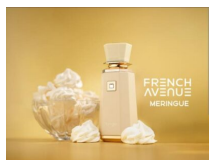
Meringue By French Avenue EDP 100ml (Dubai Replica Ladies) R350.00