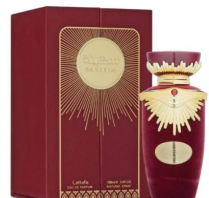
Sakeena By Lattafa R330.00 EDP 100ml (Red) (Dubai Replica Ladies)