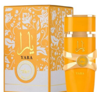
Yara Tous By R280.00 Lattafa EDP 100ml (Orange) (Dubai Replica Ladies)