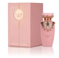
Haya By Lattafa EDP 100ml (Dubai Replica Ladies) R330.00