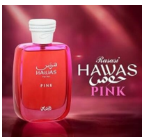
Hawas Pink By Rasasi EDP 100ml (Dubai Replica Ladies) R290.00