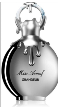
Miss Armaf GRANDEUR By Armaf EDP 100ml (Dubai Replica Ladies) R350.00