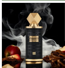
Mashrabya By Lattafa EDP 100ml (Dubai Replica Ladies) R350.00