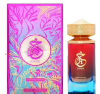
Khair Confection By Paris Corner EDP 100ml (Dubai Replica Ladies) R290.00