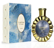
Victoria By Lattafa R340.00 EDP 100ml (Dubai Replica Ladies)