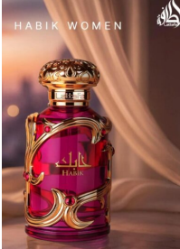
Habik Woman By Lattafa EDP 100ml (Dubai Replica Ladies) R340.00