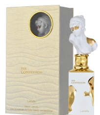
Her Confession By Lattafa EDP 100ml (Dubai Replica Ladies) R350.00