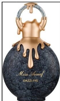
Miss Armaf DAZZLING By Armaf EDP 100ml (Dubai Replica Ladies) R350.00