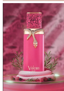
Vulcan BAIE By R320.00 French Avenue EDP 100ml (Dubai Replica Ladies)