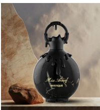
Miss Armaf MYSTIQUE By Armaf EDP 100ml (Dubai Replica Ladies) R350.00