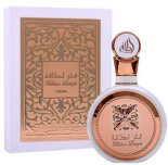
Fakhar Ladies By Lattafa EDP 100ml (Dubai Replica Ladies) R330.00