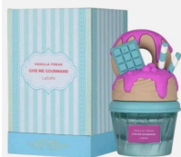
Give Me Gourmand VANILLA FREAK By Lattafa EDP 75ml (Dubai Replica Ladies) R350.00