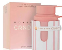
Odyssey Candee R290.00 EDP 100ml (Dubai Replica Ladies)