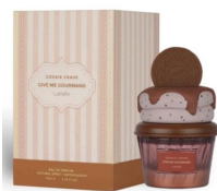
Give Me Gourmand COOKIE CRAVE By Lattafa EDP 75ml (Dubai Replica Ladies) R350.00