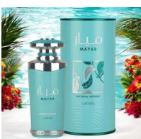
Mayar Natural Intense By Lattafa EDP 100ml (Blue Tin) (Dubai Replica Ladies) R300.00