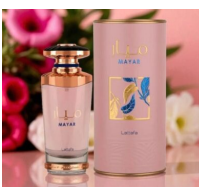
Mayar By Lattafa EDP 100ml (Pink Tin) (Dubai Replica Ladies) R300.00