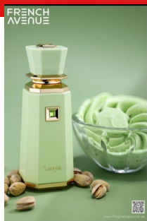
Luscious By French Avenue EDP 100ml (Dubai Replica Ladies) R350.00