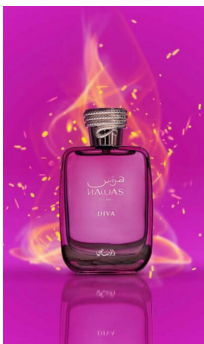
Hawas Diva By Rasasi EDP 100ml (Dubai Replica Ladies) R290.00