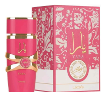
Yara Candy By R280.00 Lattafa EDP 100ml (Dubai Replica Ladies)