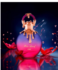
Miss Armaf CHIC By Armaf EDP 100ml (Dubai Replica Ladies) R350.00