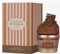
Give Me Gourmand CHOCO OVERDOSE By Lattafa EDP 75ml (Dubai Replica Ladies) R350.00