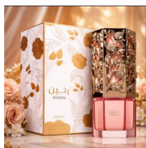
Raneen By Asdaaf R310.00 EDP 80ml (Dubai Replica Ladies)