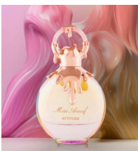
Miss Armaf ATTITUDE By Armaf EDP 100ml (Dubai Replica Ladies) R350.00