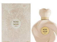
Rose Noir By R320.00 Ahmed Al Maghribi EDP 75ml (Dubai Replica Ladies)