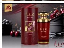
Mayar Cherry Intense By Lattafa EDP 100ml (Maroon Tin) (Dubai Replica Ladies) R300.00