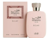
Hawas Eclat By Rasasi EDP 100ml (Dubai Replica Ladies) R290.00