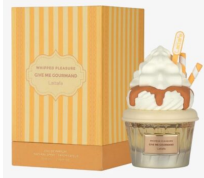
Give Me Gourmand WHIPPED PLEASURE By Lattafa EDP 75ml (Dubai Replica Ladies) R350.00