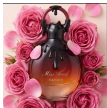
Miss Armaf MAGNIFIQ By Armaf EDP 100ml (Dubai Replica Ladies) R350.00