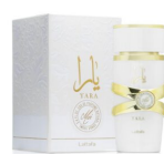
Yara Moi By Lattafa R280.00 EDP 100ml (White) (Dubai Replica Ladies)