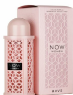
Now Women By R310.00 Rave EDP 100ml (Dubai Replica Ladies)