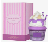
Give Me Gourmand MALLOW MADNESS By Lattafa EDP 75ml (Dubai Replica Ladies) R350.00