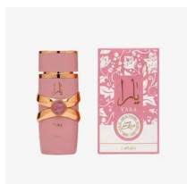
Yara ELIXIR By R280.00 Lattafa EDP 100ml (Dubai Replica Ladies)