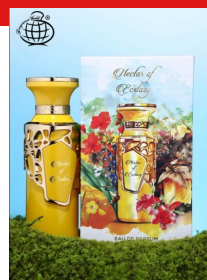
Nectar Of Ecstasy R330.00 By Fragrance World EDP 100ml (Dubai Replica Ladies)