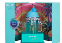
Island Bliss By Armaf EDP 100ml (Dubai Replica Ladies) R380.00