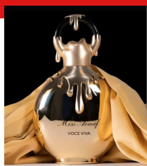
Miss Armaf VOCA R350.00 VIVA By Armaf EDP 100ml (Dubai Replica Ladies)