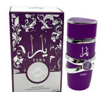
Yara Tendre By R280.00 Lattafa EDP 100ml (Purple) (Dubai Replica Ladies)