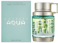
Odyssey Aqua By Armaf EDP 100ml (Dubai Replica Men) R290.00