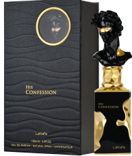
His Confession By Lattafa EDP 100ml (Dubai Replica Men) R380.00