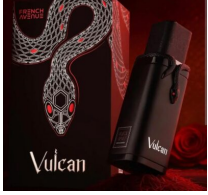
Vulcan Black Friday By French Avenue EDP 100ml (Dubai Replica Men) R320.00