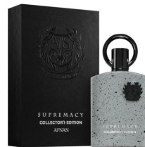
Supremacy Collector's Edition By Afnan EDP 100ml (Dubai Replica Men) R340.00