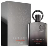
Supremacy Not Only Intense By Afnan EDP 100ml (Dubai Replica Men) R370.00