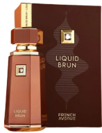
Liquid Brun By French Avenue EDP 100ml (Dubai Replica Men) R360.00