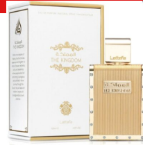
The Kingdom By Lattafa 100ml (Dubai Replica Men) R350.00