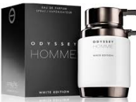
Odyssey Homme White Edition By Armaf EDP 100ml (Dubai Replica Men) R290.00