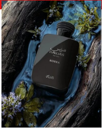
Hawas Kobra By Rasasi EDP 100ml (Dubai Replica Men) R300.00