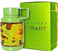
Odyssey Tyrant Special Edition By Armaf EDP 100ml (Dubai Replica Men) R290.00