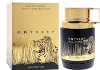
Odyssey Wild One Gold Edition By Armaf EDP 100ml (Dubai Replica Men) R290.00