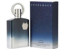
Supremacy Incense By Afnan EDP 100ml (Dubai Replica Men) R340.00