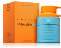
Odyssey Mandarin Sky Limited Edition By Armaf EDP 100ml (Dubai Replica Men) R290.00