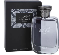
Nawas For Him By Rasasi EDP 100ml (Dubai Replica Men) R290.00