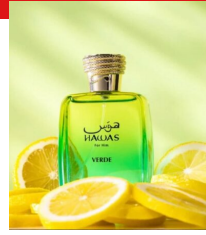
Hawas Verde By Rasasi EDP 100ml (Dubai Replica Men) R300.00