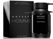
Odyssey Homme By Armaf EDP 100ml (Dubai Replica Men) R290.00