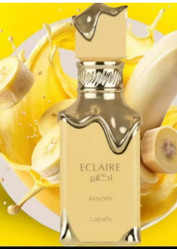
Eclaire Banoffi By Lattafa EDP 100ml (Dubai Replica Unisex) R330.00 R250.00