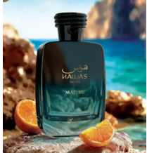
Hawas Malibu EDP 100ml (Dubai Replica Unisex) R290.00 R210.00