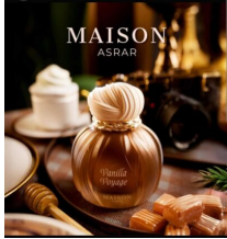
Vanilla Voyage By R350.00 R270.00 Maison Asrar EDP 100ml (Dubai Replica Unisex)