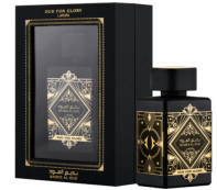
Badee Al Oud 'Oud For Glory' By Lattafa EDP 100ml (Black) (Dubai Replica Unisex) R320.00 R240.00