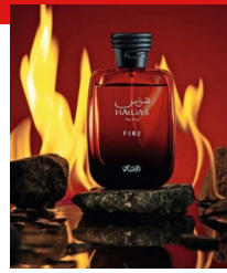
Hawas Fire By Rasasi EDP 100ml (Dubai Replica Unisex) R290.00 R210.00