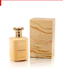
Taskeen Caramel R310.00 R230.00 Cascade By Paris Corner EDP 100ml (Dubai Replica Unisex)