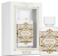
Badee Al Oud Honour and Glory By Lattafa EDP 100ml (White) (Dubai Replica Unisex) R310.00 R230.00