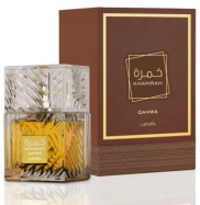
Khamrah Qahwa By Lattafa EDP 100ml (Dubai Replica Unisex) R330.00 R250.00