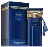
Historic Olmeda By Afnan EDP 100ml (Dubai Replica Unisex) R330.00 R250.00