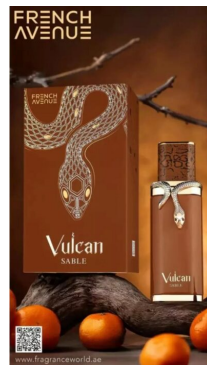
Vulcan Sable By R320.00 R240.00 French Avenue EDP 100ml (Dubai Replica Unisex)