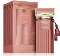
Historic Doria By Afnan EDP 100ml (Dubai Replica Unisex) R330.00 R250.00