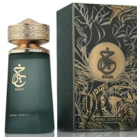
Khair By Paris Corner EDP 100ml (Dubai Replica Unisex) R290.00 R210.00