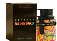
Odyssey BA HA MAS By Armaf EDP 100ml (Dubai Replica Unisex) R290.00 R210.00