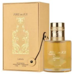
Fire On Ice By Lattafa EDP 110ml (Dubai Replica Unisex) R340.00 R260.00