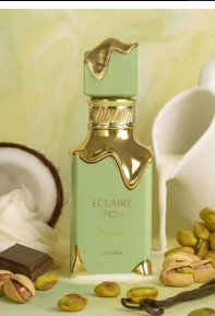
Eclaire Pistache By Lattafa EDP 100ml (Dubai Replica Unisex) R330.00 R250.00