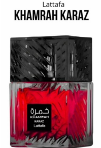
Lattafa KHAMRAH KARAZ Khamrah Karaz By Lattafa EDP 100ml (Dubai Replica Unisex) R330.00 R250.00