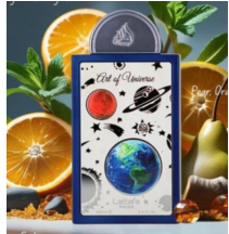
Art Of Universe By Lattafa EDP 100ml (Dubai Replica Unisex) R330.00 R250.00