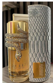
Musamam White Intense EDP 100ml (Dubai Replica Unisex) R340.00 R260.00