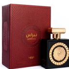
Nebras By Lattafa EDP 100ml (Dubai Replica Unisex) R380.00 R300.00