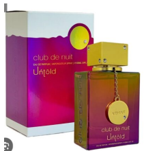
Club De Nuit Untold By Armaf EDP 105ml (Dubai Replica Unisex) R320.00 R240.00