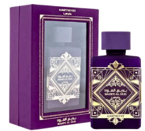
Badee Al Oud Amethyste By Lattafa EDP 100ml (Purple) (Dubai Replica Unisex) R310.00 R230.00