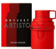
Odyssey Artisto By Armaf EDP 100ml (Dubai Replica Unisex) R300.00 R220.00