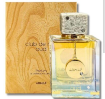
Club De Nuit OUD By Armaf EDP 105ml (Dubai Replica Unisex) R320.00 R240.00