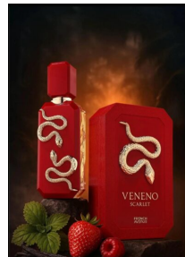
Veneno Scarlet By R350.00 R270.00 French Avenue EDP 100ml (Dubai Replica Unisex)