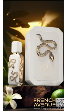
Veneno Bianco By R350.00 R270.00 French Avenue EDP 100ml (Dubai Replica Unisex)