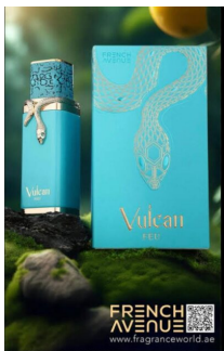
Vulcan Feu By R320.00 R240.00 French Avenue EDP 100ml (Dubai Replica Unisex)