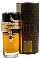
Musamam EDP 100ml (Dubai Replica Unisex) R340.00 R260.00