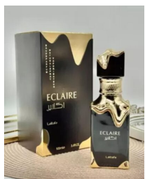
Eclaire Black By Lattafa EDP 100ml (Dubai Replica Unisex) R330.00 R250.00