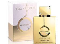
Club De Nuit Milestone EDP 105ml (Dubai Replica Unisex) R350.00 R270.00