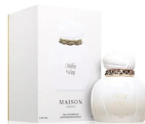
Milky Way By Maison Asrar EDP 100ml (Dubai Replica Unisex) R340.00 R260.00