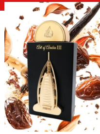
Art Of Arabia III By Lattafa EDP 100ml (Dubai Replica Unisex) R330.00 R250.00