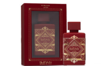
Badee Al Oud Sublime By Lattafa EDP 100ml (Red) (Dubai Replica Unisex) R310.00 R230.00