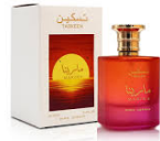
Taskeen Marina By R310.00 R230.00 Paris Corner EDP 100ml (Dubai Replica Unisex)