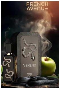
Veneno By French R350.00 R270.00 Avenue EDP 100ml (Dubai Replica Unisex)