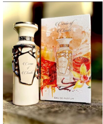
Creme Of Clouds By Fragrance World EDP 100ml (Dubai Replica Unisex) R330.00 R250.00