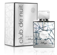
Club De Nuit Sillage By Armaf EDP 105ml (Dubai Replica Unisex) R350.00 R270.00