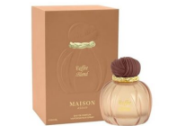
Coffee Blend By Maison Asrar EDP 100ml (Dubai Replica Unisex) R340.00 R260.00