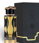
Tariaq Intense By R320.00 Lattafa EDP 100ml (Dubai Replica Unisex)