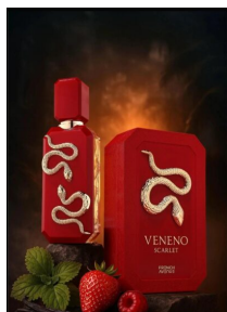
Veneno Scarlet By R350.00 French Avenue EDP 100ml (Dubai Replica Unisex)