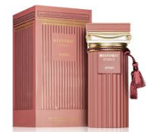
Historic Doria By R330.00 Afnan EDP 100ml (Dubai Replica Unisex)