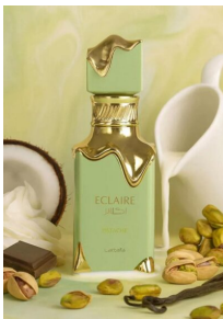
Eclaire Pistache By R330.00 Lattafa EDP 100ml (Dubai Replica Unisex)