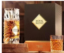
Royal Blend Nero R350.00 By French Avenue EDP 100ml (Dubai Replica Unisex)