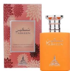
Taskeen By Paris R310.00 Corner EDP 100ml (Dubai Replica Unisex)