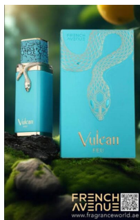
Vulcan Feu By R320.00 French Avenue EDP 100ml (Dubai Replica Unisex)