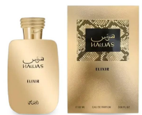
Hawas Elixir By R290.00 Rasasi EDP 100ml (Dubai Replica Unisex)