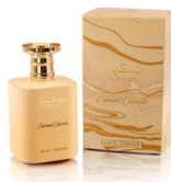
Taskeen Caramel R310.00 Cascade By Paris Corner EDP 100ml (Dubai Replica Unisex)