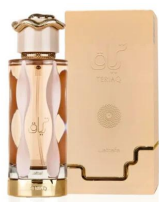
Tariaq By Lattafa R320.00 EDP 100ml (Dubai Replica Unisex)