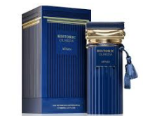
Historic Olmeda By R330.00 Afnan EDP 100ml (Dubai Replica Unisex)