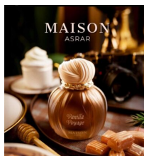
Vanilla Voyage By R350.00 Maison Asrar EDP 100ml (Dubai Replica Unisex)