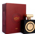
Nebras By Lattafa R380.00 EDP EDP 100ml (Dubai Replica Unisex)