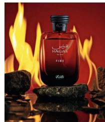
Hawas Fire By R290.00 Rasasi EDP 100ml (Dubai Replica Unisex)