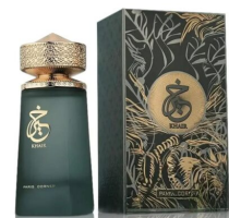
Khair By Paris R290.00 Corner EDP 100ml (Dubai Replica Unisex)