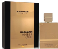
Haramain Amber R390.00 Oud Gold Edition By Al Haramain EDP 60ml (Dubai Replica Unisex)