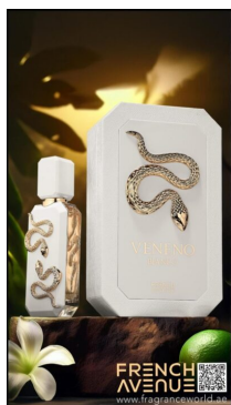
Veneno Bianco By R350.00 French Avenue EDP 100ml (Dubai Replica Unisex)