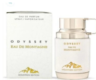
Odyssey Eau De R290.00 Montagne EDP 100ml (Dubai Replica Unisex)