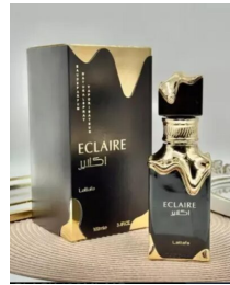
Eclaire Black By R330.00 Lattafa EDP 100ml (Dubai Replica Unisex)