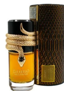
Musamam EDP R340.00 100ml (Dubai Replica Unisex)