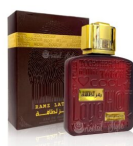
Ramz By Lattafa R270.00 EDP 100ml (Gold) (Dubai Replica Unisex)