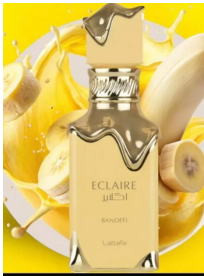
Eclaire Banoffi By R330.00 Lattafa EDP 100ml (Dubai Replica Unisex)