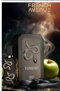
Veneno By French R350.00 Avenue EDP 100ml (Dubai Replica Unisex)