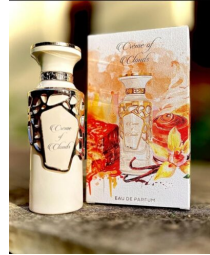
Creme Of Clouds By R330.00 Fragrance World EDP 100ml (Dubai Replica Unisex)