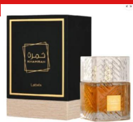
Khamrah By Lattafa R330.00 EDP 100ml (Dubai Replica Unisex)