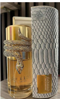
Musamam White R340.00 Intense EDP 100ml (Dubai Replica Unisex)