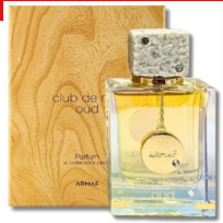
Club De Nuit OUD R320.00 By Armaf EDP 105ml (Dubai Replica Unisex)