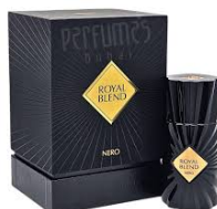
Royal Blend Nero R350.00 By French Avenue EXTRAIT DE PARFUM 100ml (Dubai Replica Unisex)