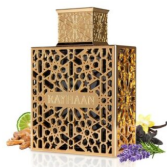
Rayhaan Elixir EDP R300.00 100ml (Dubai Replica Unisex)