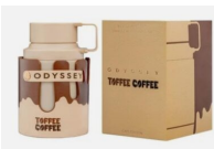
Odyssey Coffee R300.00 Toffee By Armaf EDP 100ml (Dubai Replica Unisex)