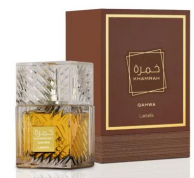
Khamrah Qahwa By R330.00 Lattafa EDP 100ml (Dubai Replica Unisex)