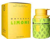
Odyssey Limoni By R290.00 Armaf EDP 100ml (Dubai Replica Unisex)