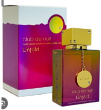
Club De Nuit Untold R320.00 By Armaf EDP 105ml (Dubai Replica Unisex)