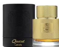
Qaa'ed By Lattafa R350.00 EDP 100ml (Dubai Replica Unisex)