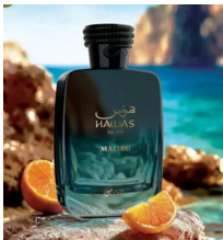
Hawas Malibu EDP R290.00 100ml (Dubai Replica Unisex)