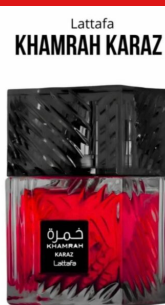
Lattafa KHAMRAH KARAZ Khamrah Karaz By Lattafa R330.00 Lattafa EDP 100ml (Dubai Replica Unisex)