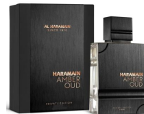
Haramain Amber R390.00 Oud Private Edition By Al Haramain EDP 60ml (Dubai Replica Unisex)