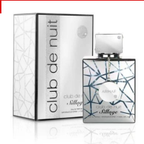
Club De Nuit Sillage R350.00 By Armaf EDP 105ml (Dubai Replica Unisex)