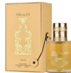
Fire On Ice By R340.00 Lattafa EDP 110ml (Dubai Replica Unisex)