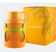
Odyssey Go Mango R300.00 By Armaf EDP 100ml (Dubai Replica Unisex)