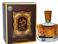
Oud Al Layl By Arabiyat EDP 100ml (Dubai Replica Unisex)