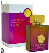
Club De Nuit Untold R320.00 By Armaf EDP 105ml (Dubai Replica Unisex)