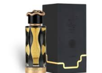
Tariaq Intense By R320.00 Lattafa EDP 100ml (Dubai Replica Unisex)