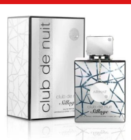
Club De Nuit Sillage R350.00 By Armaf EDP 105ml (Dubai Replica Unisex)