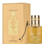
Fire On Ice By R340.00 Lattafa EDP 110ml (Dubai Replica Unisex)