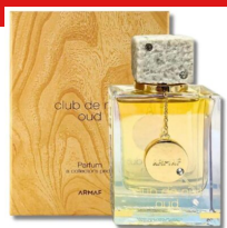
Club De Nuit OUD R320.00 By Armaf EDP 105ml (Dubai Replica Unisex)