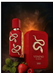
Veneno Scarlet By R350.00 French Avenue EDP 100ml (Dubai Replica Unisex)