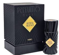
Royal Blend Nero R350.00 By French Avenue EXTRAIT DE PARFUM 100ml (Dubai Replica Unisex)