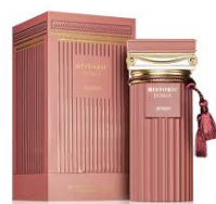
Historic Doria By R330.00 Afnan EDP 100ml (Dubai Replica Unisex)