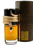
Musamam EDP 100ml (Dubai Replica Unisex)