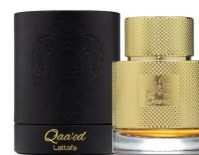
Qaa'ed By Lattafa EDP 100ml (Dubai Replica Unisex)