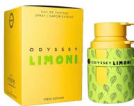
Odyssey Limoni By Armaf EDP 100ml (Dubai Replica Unisex)