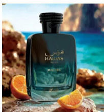
Hawas Malibu EDP R290.00 100ml (Dubai Replica Unisex)