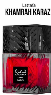
Lattafa KHAMRAH KARAZ EDP 100ml (Dubai Replica Unisex)