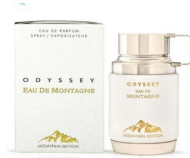
Odyssey Eau De Montagne EDP 100ml (Dubai Replica Unisex)