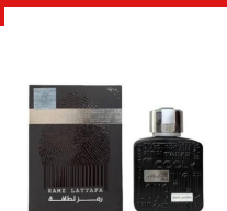
Ramz By Lattafa R270.00 EDP 100ml (Silver) (Dubai Replica Unisex)