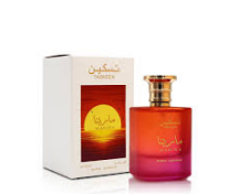
Taskeen Marina By R310.00 Paris Corner EDP 100ml (Dubai Replica Unisex)