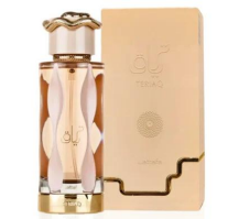
Tariaq By Lattafa R320.00 EDP 100ml (Dubai Replica Unisex)