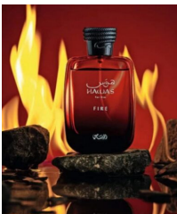
Hawas Fire By R290.00 Rasasi EDP 100ml (Dubai Replica Unisex)