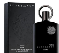
Supremacy Noir By R330.00 Afnan EDP 100ml (Dubai Replica Unisex)