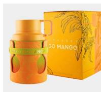
Odyssey Go Mango By Armaf EDP 100ml (Dubai Replica Unisex)