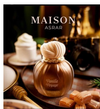
Vanilla Voyage By R350.00 Maison Asrar EDP 100ml (Dubai Replica Unisex)