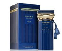
Historic Olmeda By R330.00 Afnan EDP 100ml (Dubai Replica Unisex)