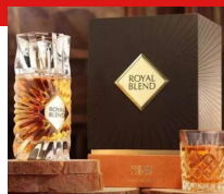
Royal Blend Nero R350.00 By French Avenue EDP 100ml (Dubai Replica Unisex)