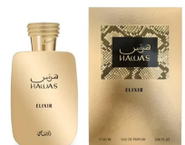
Hawas Elixir By R290.00 Rasasi EDP 100ml (Dubai Replica Unisex)