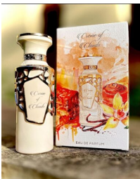
Creme Of Clouds By R330.00 Fragrance World EDP 100ml (Dubai Replica Unisex)