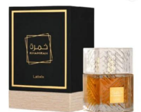
Khamrah By Lattafa R330.00 EDP 100ml (Dubai Replica Unisex)