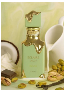
Eclaire Pistache By R330.00 Lattafa EDP 100ml (Dubai Replica Unisex)