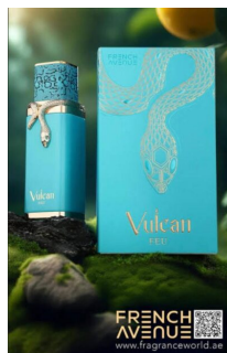
Vulcan Feu By R320.00 French Avenue EDP 100ml (Dubai Replica Unisex)