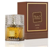
Khamrah Qahwa By Lattafa EDP 100ml (Dubai Replica Unisex)