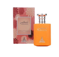
Taskeen By Paris R310.00 Corner EDP 100ml (Dubai Replica Unisex)