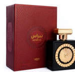
Nebras By Lattafa EDP 100ml (Dubai Replica Unisex)