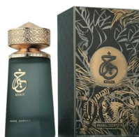
Khair By Paris R290.00 Corner EDP 100ml (Dubai Replica Unisex)