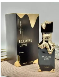
Eclaire Black By R330.00 Lattafa EDP 100ml (Dubai Replica Unisex)