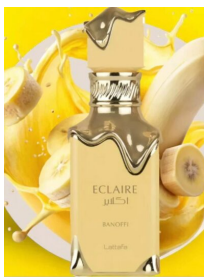
Eclaire Banoffi By R330.00 Lattafa EDP 100ml (Dubai Replica Unisex)