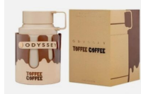
Odyssey Coffee Toffee By Armaf EDP 100ml (Dubai Replica Unisex)