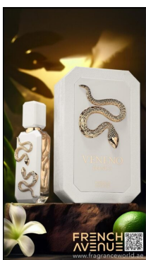
Veneno Bianco By R350.00 French Avenue EDP 100ml (Dubai Replica Unisex)