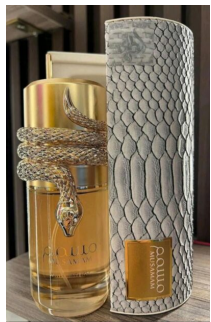
Musamam White Intense EDP 100ml (Dubai Replica Unisex)