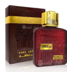
Ramz By Lattafa EDP 100ml (Gold) (Dubai Replica Unisex)