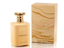
Taskeen Caramel R310.00 Cascade By Paris Corner EDP 100ml (Dubai Replica Unisex)