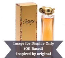
Organza (Inspired R150.00 – R350.00 by)