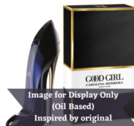
CH Good Girl (Inspired by)