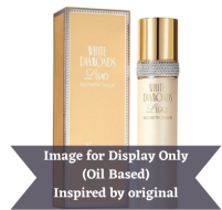
White Diamonds (Inspired by)