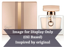
Gucci by Gucci Ladies (Inspired by) R150.00 - R350.00