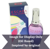
Moon Sparkle by Escada (Inspired by) R150.00 - R350.00