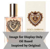
Dolce and Gabbana Devotion (Inspired by) R150.00 - R350.00