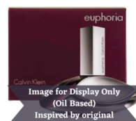
CK Euphoria Ladies (Inspired by)