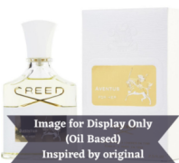
Creed Aventus Ladies (Inspired by)