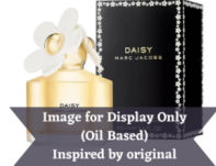
Daisy - Marc Jacobs (Inspired by)