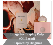
Guidance by Amouage (Unisex) (Inspired by) R150.00 - R350.00