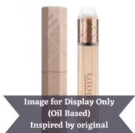
Burberry Body (Inspired by)