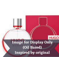
Hugo Boss Woman (Inspired by) R150.00 - R350.00