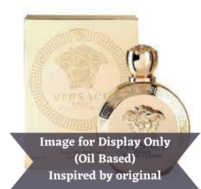
Versace Eros Femme (Inspired by)