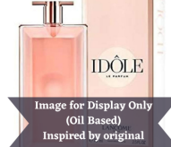
Idole - Lancome (Inspired by) R150.00 - R350.00