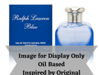
Ralph Lauren Blue Ladies (Inspired by)