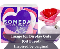
Some Day/Justin Bieber (Inspired by)