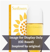
Sunflower - Elizabeth Arden (Inspired by)