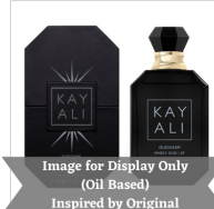
Oudgasm Smoky R150.00 – R350.00 Oud by Kayali (Unisex) (Inspired by)