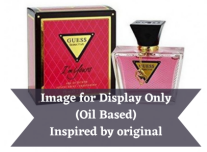
Guess Seductive I'm Yours (Inspired by) R150.00 - R350.00