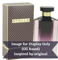
Stella McCartney (Inspired by)