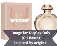
Paco Rabanne R150.00 – R350.00 Olympea (Inspired by)