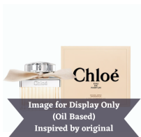
Chloe (Inspired by)