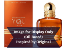
Armani- Stronger with you Amber (Inspired by)