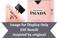
Prada Paradoxe (Inspired by)