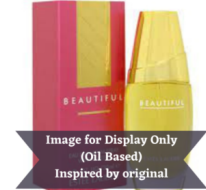
Beautiful – Estee Lauder (Inspired by)