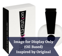
Exclamation (Inspired by) R150.00 - R350.00