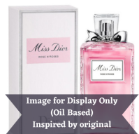
Miss Dior Rose 'n Roses (Inspired by) R150.00 - R350.00