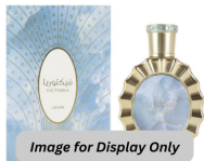
Victoria (Unisex) (Inspired by)