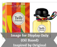
Twilly D'Hermes (Inspired by)