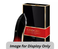
Good Girl Very Elixir (Inspired by) R150.00 - R350.00