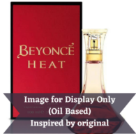
Beyonce Heat (Inspired by)