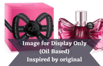
Victor and Rolf Bon- Bon(Inspired by)