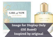
Elie Saab Girl of Now (Inspired by) R150.00 - R350.00