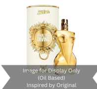
Jean Paul Gaultier – R150.00 – R350.00 Divine (Inspired by)