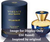
Versace Dylan Blue Ladies (Inspired by)