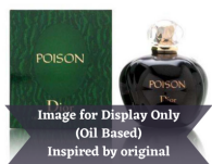
Poison – Dior (Inspired by)