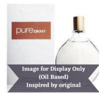
DKNY Pure (Inspired by) R150.00 - R350.00