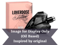
Diesel Loverdose Tattoo (Inspired by) R150.00 - R350.00