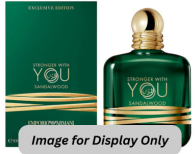
Armani Stronger With You Sandlewood (Unisex) (Inspired by)