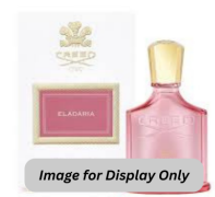
Creed Eladaria (Inspired by)