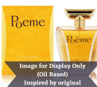
Poeme – Lancome R150.00 – R350.00 (Inspired by)