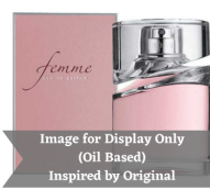
Hugo Boss Femme (Inspired by) R150.00 - R350.00