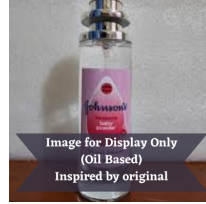
Baby Johnson (Unisex) (Inspired by)