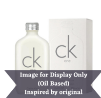
CK-One (Unisex) (Inspired by)