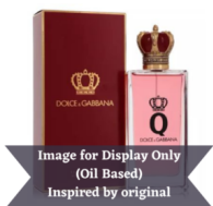
Queen by Dolce and Gabbana (Inspired by)