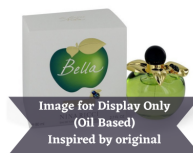
Nina Ricci – Bella R150.00 – R350.00 (Inspired by)