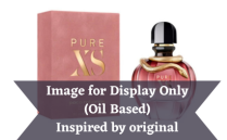
Paco Rabanne Pure R150.00 – R350.00 XS (Inspired by)