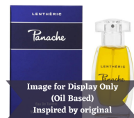
Panache (Inspired R150.00 – R350.00 by)