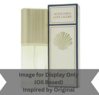
White Linen by Estee Lauder (Inspired by)