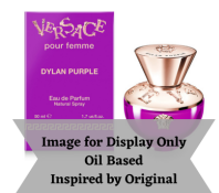
Versace Dylan Purple (Inspired by)