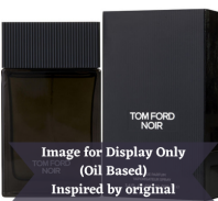
Tom Ford Noir (Unisex) (Inspired by)