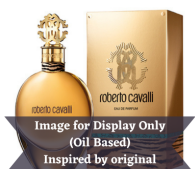
Roberto Cavalli (Inspired by)