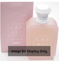
Vanilla Powder by Matiere Premiere (Inspired by)