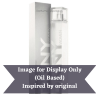
DKNY Ladies (Inspired by) R150.00 - R350.00