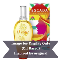
Taj Sunset Escada (Inspired by)