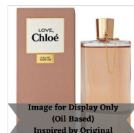
Chloe Love (Inspired by)