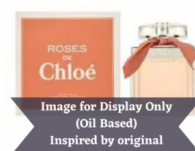
Chloe Roses (Inspired by)