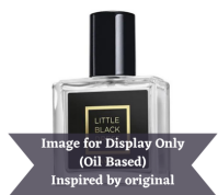
Little Black Dress (Inspired by) R150.00 - R350.00