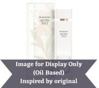
White Tea/ Elizabeth Arden (Inspired by)