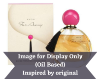
Far Away (Inspired by) R150.00 - R350.00