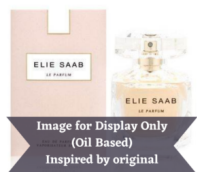
Elie Saab (Inspired by) R150.00 - R350.00