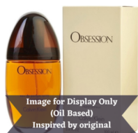
CK Obsession Ladies (Inspired by)