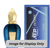
Torino 24 (Unisex) (Inspired by)