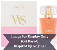
White Satin (Inspired by)