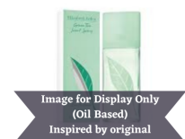
Green Tea - Elizabeth Arden (Inspired by) R150.00 - R350.00