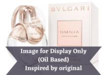
Bvlgari Crystalline (Inspired by)