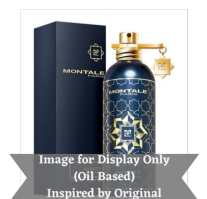
Infinity by Montale (Unisex) (Inspired by) R150.00 - R350.00