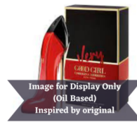
CH Very Good Girl (Inspired by)