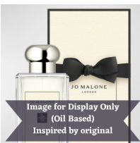
Jo Malone – R150.00 – R350.00 Grapefruit (Unisex) (Inspired by)