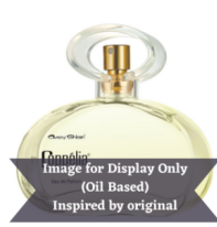
Coppelia (Inspired by)