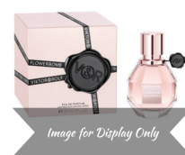
Flower Bomb by Victor and Rolf (Inspired by) R150.00 - R350.00