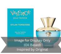
Versace Dylan Turquoise (Inspired by)