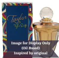
Taylor Swift for her (Inspired by)