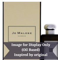
Jo Malone – Myrrh R150.00 – R350.00 and Tonka (Unisex) (Inspired by)