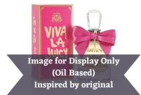
Viva La Juicy Couture (Inspired by)