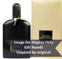
Black Orchid (Unisex) – Tom Ford (Inspired by)