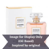
Coco Chanel Mademoiselle (Inspired by)