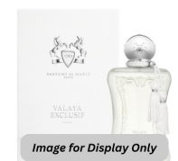
De Marly Valaya Exclusif (Inspired by)