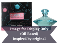
Britney Curious (Inspired by)