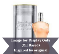
Jean Paul Gaultier R150.00 – R350.00 Classique (Inspired by)