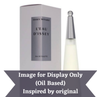
Issey Miyake Ladies R150.00 – R350.00 (Inspired by)