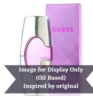
Guess Woman (Inspired by) R150.00 - R350.00