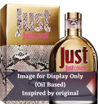
Roberto Cavalli/Just Cavalli (Inspired by)