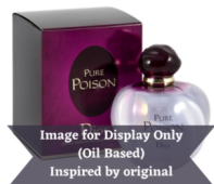
Pure Poison by Dior (Inspired by)