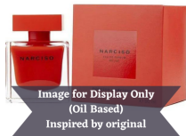
Narciso Rodriguez R150.00 – R350.00 Rouge (Inspired by)