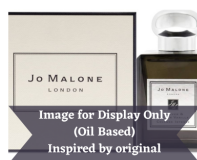
Jo Malone – Vetvier R150.00 – R350.00 and Golden Vanilla (Unisex) (Inspired by)