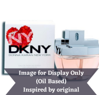
My NY DKNY (Inspired by) R150.00 - R350.00