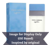
D and G Light Blue Ladies (Inspired by)