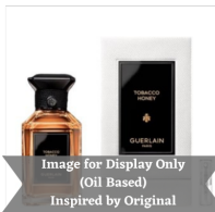
Tobacco Honey by Guerlain (Unisex) (Inspired by)