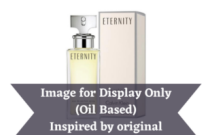
CK Eternity (Inspired by)