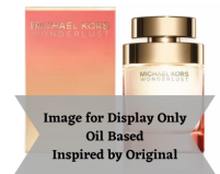
Wonderlust by Michael Kors (Inspired by)