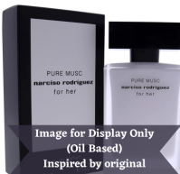
Narciso Rodriguez Pure Musk (Inspired by) R150.00 - R350.00