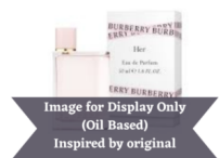
Burberry Her (Inspired by)