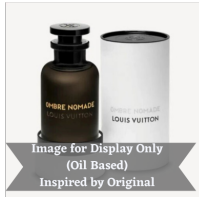
Louis Vuitton Ombre Nomade (Unisex) (Inspired by) R150.00 - R350.00