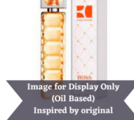
Hugo Boss Orange Ladies (Inspired by) R150.00 - R350.00