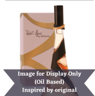
Rihanna Reb'l Fleur (Inspired by)