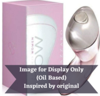
Azzaro Now Ladies (Inspired by)