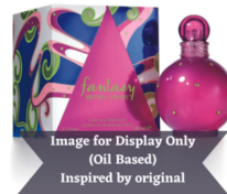
Britney Fantasy (Inspired by)