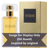
Spellbound (Inspired by)