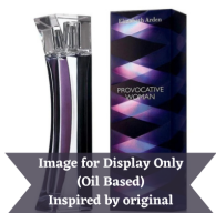
Provocative (Inspired by)