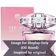
Versace Bright Crystal (Inspired by)