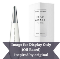
Issey Miyake Pure R150.00 – R350.00 (Inspired by)