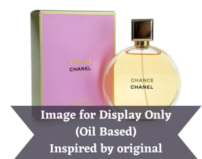
Chanel Chance (Inspired by)