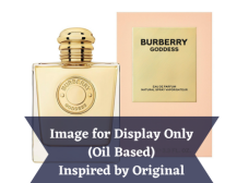
Burberry Goddess (Inspired by)