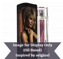
Paris Hilton Heiress R150.00 – R350.00 (Inspired by)