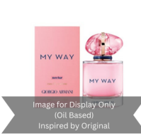
My Way Nectar by Giorgio Armani (Inspired by) R150.00 - R350.00