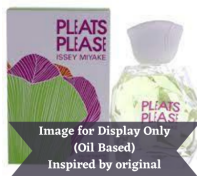
Issey Miyake Pleats R150.00 – R350.00 Please (Inspired by)