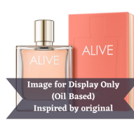
Hugo Boss Alive (Inspired by) R150.00 - R350.00