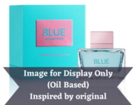
Blue Seduction - Antonio Banderas for Ladies (Inspired by)