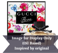
Gucci Flora (Inspired by) R150.00 - R350.00