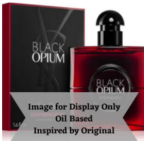
Black Opium Over Red (Inspired by)