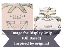
Gucci Bamboo (Inspired by) R150.00 - R350.00