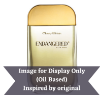
Endangered for her (Inspired by) R150.00 - R350.00