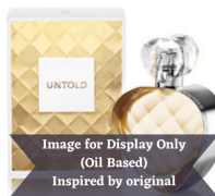
Untold - Elizabeth Arden (Inspired by)