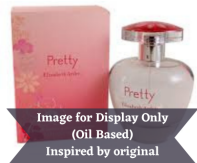
Pretty – Elizabeth Arden (Inspired by)