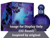
Britney Fantasy Midnight (Inspired by)