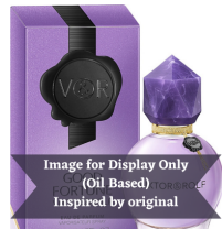
Victor and Rolf Good Fortune (Inspired by)