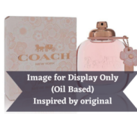
Coach Floral (Inspired by)