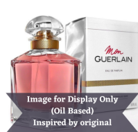
Mon Guerlain (Inspired by) R150.00 - R350.00