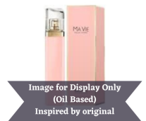
Hugo Boss Ma Vie Pour Femme (Inspired by) R150.00 - R350.00