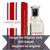
Tommy Girl (Inspired by)