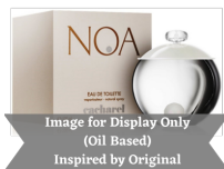
Cacharel Noa (Inspired by)