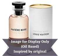
Louis Vuitton Matiere Noire (Inspired by) R150.00 - R350.00