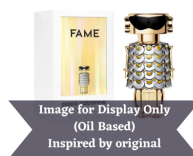
Paco Rabanne R150.00 – R350.00 Fame (Inspired by)