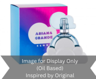
Cloud by Ariana Grande (Inspired by)