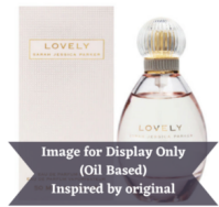
Lovely by Sarah Jessica Parker (Inspired by) R150.00 - R350.00