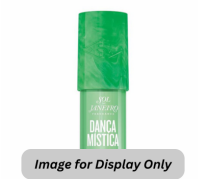
Danca Mistica (Inspired by)