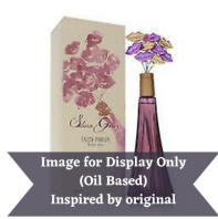
Selena Gomez for her (Inspired by)