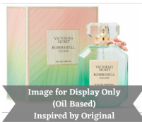
Victoria's Secret – Bombshell Escape (Inspired by)