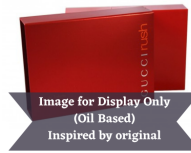
Gucci Rush (Inspired by) R150.00 - R350.00