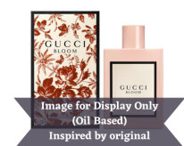
Gucci Bloom (Inspired by) R150.00 - R350.00