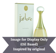
J'adore – Dior R150.00 – R350.00 (Inspired by)