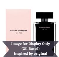
Narciso Rodriguez (Inspired by) R150.00 - R350.00