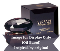
Versace Crystal Noir (Inspired by)