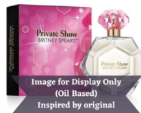
Britney Private Show (Inspired by)