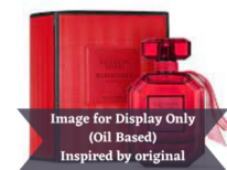
Bombshell Intense by Victoria Secret (Inspired by)