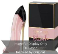
CH Good Girl Blush (Inspired by)