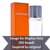
Clinique Happy Ladies (Inspired by)