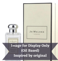
Jo Malone – English R150.00 – R350.00 Pear and Freesia (Unisex) (Inspired by)