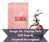
Jean Paul Gaultier R150.00 – R350.00 Scandal Ladies (Inspired by)