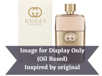
Gucci Guilty Ladies (Inspired by) R150.00 - R350.00