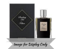
Smoking Hot by Kilian (Unisex) (Inspired by)