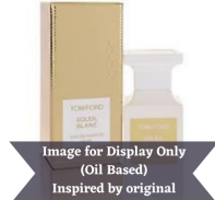
Tom Ford Soleil Blanc (Unisex) (Inspired by)