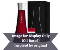
Hugo Boss Deep Red (Inspired by) R150.00 - R350.00