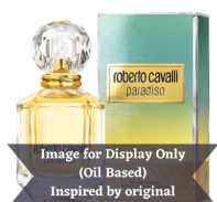
Roberto Cavalli Paradiso (Inspired by)