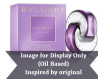
Bvlgari Amethyste (Inspired by)