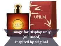
Opium – YSL R150.00 – R350.00 (Inspired by)