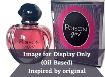
Poison Girl – Dior (Inspired by)