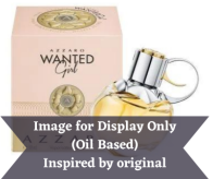
Wanted – Azzaro for Her (Inspired by)