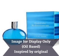
Mediterranean (Inspired by) R150.00 - R350.00