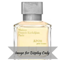
Maison Francis Kurkdjian Apom (Unisex)- (Inspired by) R150.00 - R350.00