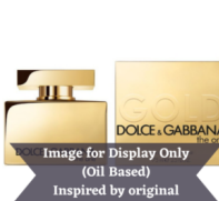
D and G The One Ladies (Inspired by)