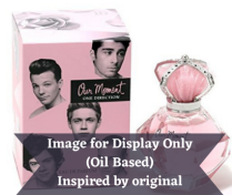
Our Moment – One R150.00 – R350.00 Direction (Inspired by)