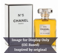
Chanel No 5 (Inspired by)