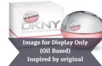
DKNY Fresh Blossom (Inspired by) R150.00 - R350.00