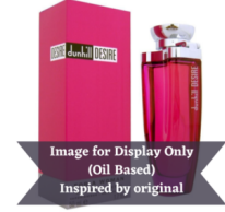
Dunhill Desire Ladies (Inspired by) R150.00 - R350.00