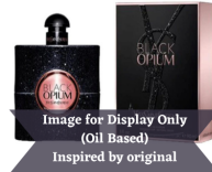
Opium Black – YSL R150.00 – R350.00 (Inspired by)