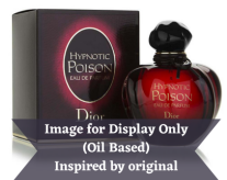
Hypnotic Poison - Dior (Inspired by) R150.00 - R350.00