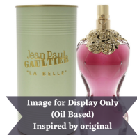
Jean Paul Gaultier R150.00 – R350.00 La Belle (Inspired by)