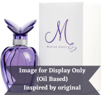
Mariah Carey - M (Inspired by) R150.00 - R350.00