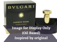
Bvlgari Jasmin Noir (Inspired by)