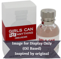
Zadig and Voltaire - Girls can say Anything (Inspired by)