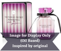
Victoria's Secret Bombshell (Inspired by)