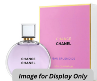
Chanel Chance Eau Splendide (Inspired by)