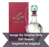
J.Lo Live (Inspired R150.00 – R350.00 by)