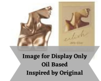
Billie Eilish (Inspired by)