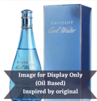
Cool Water - Davidoff Ladies (Inspired by)