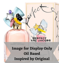
Perfect by Marc R150.00 – R350.00 Jacobs (Inspired by)