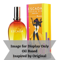
Rock 'n Rio by Escada (Inspired by)