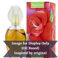
Chloe Narcisse (Inspired by)