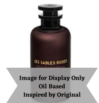
Louis Vuitton Les Sables Roses (Unisex) (Inspired by) R150.00 - R350.00