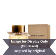
My Burberry Ladies (Inspired by) R150.00 - R350.00