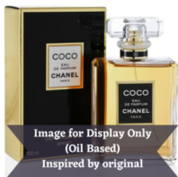
Coco Chanel (Inspired by)