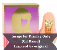
Pink Friday – Nicki R150.00 – R350.00 Minaj (Inspired by)