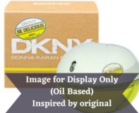
DKNY be delicious (Green) (Inspired by) R150.00 - R350.00