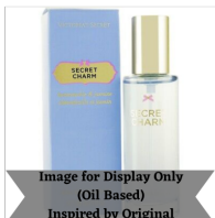
Secret Charm by Victoria's Secret (Inspired by)