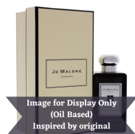
Jo Malone – Dark R150.00 – R350.00 Amber and Ginger Lily (Unisex) (Inspired by)