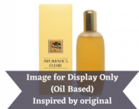
Clinique Aromatics (Inspired by)