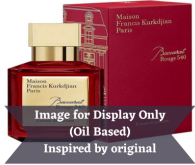
Baccarat Rouge 540 (Unisex) (Inspired by)