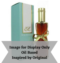
Youth Dew (Inspired by)