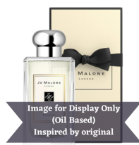
Jo Malone – Fig and R150.00 – R350.00 Lotus Flower (Unisex) (Inspired by)