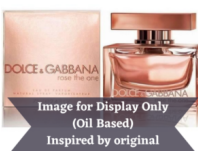
D and G The One Rose (Inspired by)