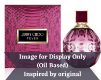
Jimmy Choo Fever R150.00 – R350.00 (Inspired by)