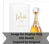
Dior J'adore L'OR (Inspired by) R150.00 - R350.00