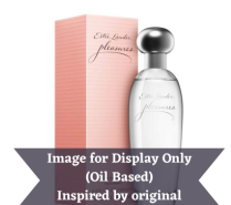
Pleasures – Estee R150.00 – R350.00 Lauder Ladies (Inspired by)