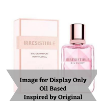
Irresistible Very Floral by Givenchy (Inspired by) R150.00 - R350.00