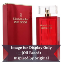
Red Door – Elizabeth Arden (Inspired by)