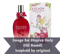
Cherry In The Air Escada (Inspired by)