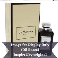
Jo Malone – Velvet R150.00 – R350.00 Rose and Oud (Unisex) (Inspired by)