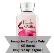
Pink Chiffon by Bath R150.00 – R350.00 and Body Works (Inspired by)