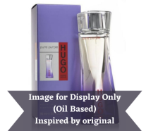
Hugo Boss Pure Purple (Inspired by) R150.00 - R350.00