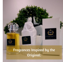
Sultan (Arabic) R150.00 – R350.00 (inspired by)