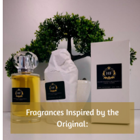
Suzerain (Arabic) R150.00 – R350.00 (inspired by)