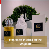
Rose Oud (Arabic) R150.00 – R350.00 (inspired by)